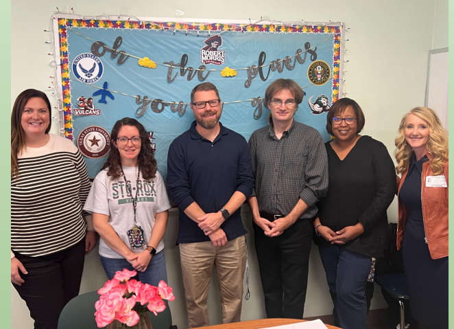
JED's On-Site Visit